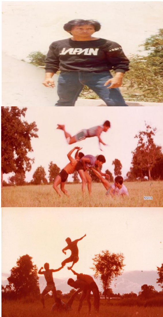
Figure 1: Panna Rittikrai (17 February 1961 – 20 July 2014) While Doing Stunt Training with His Team

From the study, the history and background of the stuntmen group in the Tha Phra community, Khon Kaen Province can be divided into three eras, consisting of the pioneering era, the flourishing era, and the current era. It was found that in the pioneering era (1981-1984), the stuntmen group in the Tha Phra community, Khon Kaen Province was established by “Panna Rittikrai”, who was known as the pioneer master of action choreography of Thailand. Panna was born and raised in Tha Phra District. He lived at 138/1, Tha Phra District, Muang District, Khon Kaen Province. Many people in the area knew him as Krittiya Ladpanna. In the past, people in the community would often see this group of people get together to jump, punch, and do flips. At the time, stuntmen, or what people called them at the time, risky scene actors, were not well-known among the general public (We Love Tha Phra, 2018).