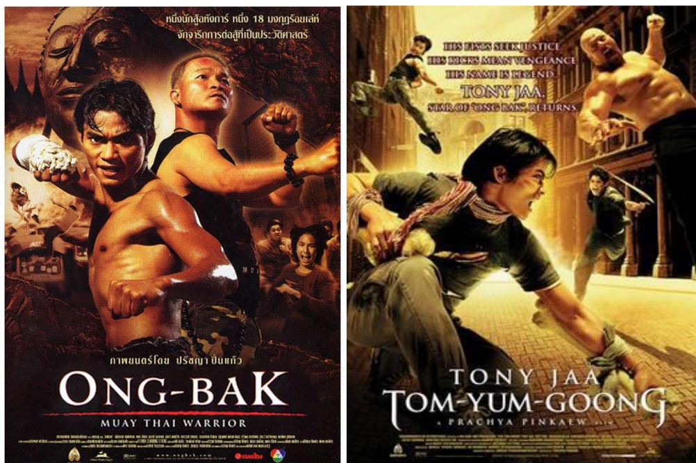
Figure 2: Poster for Ong-Bak (2003) and Tom-Yum-Goong (2005).

The Tha Phra stuntmen group had a strong network and continuing success. However, after Panna Rittikrai passed away on 20 July 2014, the stuntmen network started to scatter apart leading to its lack of strength and power of negotiation with the film producers both within the country and at the international level, causing the group to lose its income and opportunity in entering the film industry.