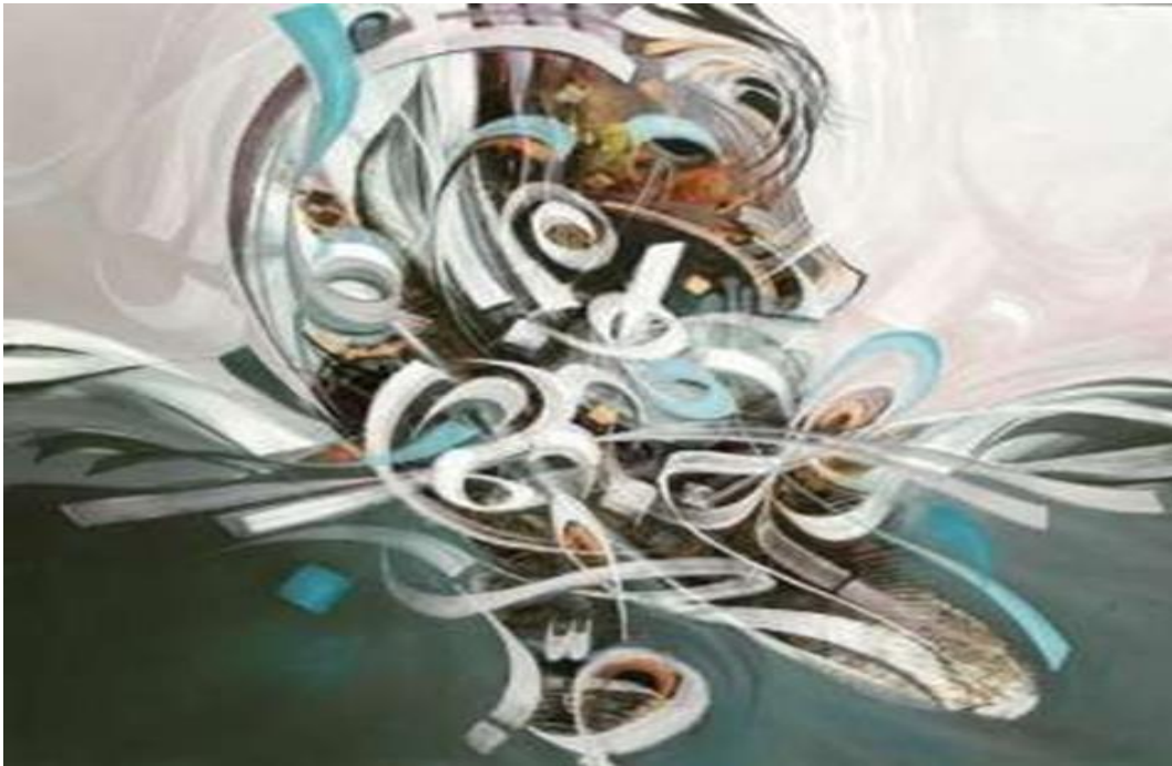
Figure No. (10).