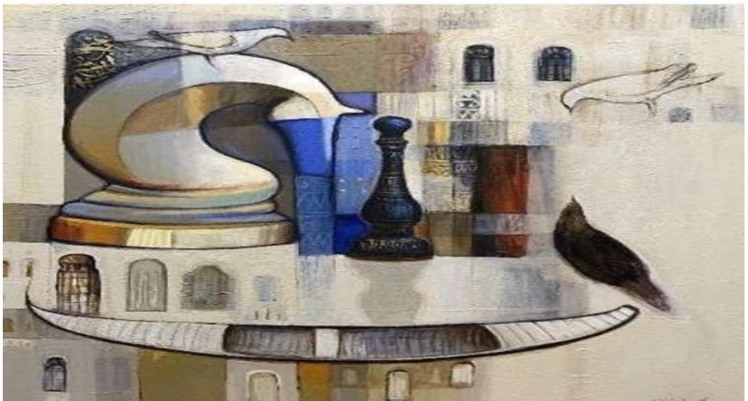
Figure No. (9).