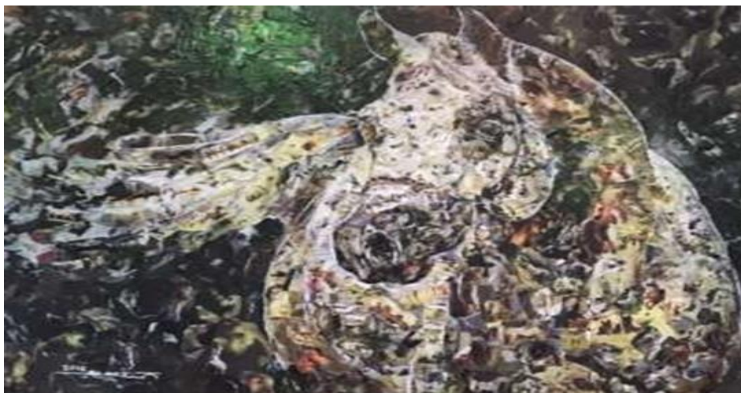
Figure No. (5).

Figure (6) also appears in the work of the artist Muhammad Asiri, his use of paper materials from short stories