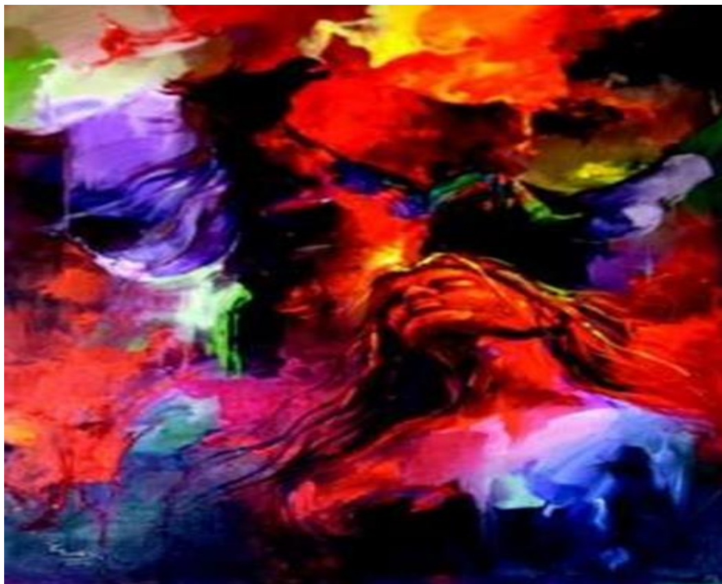
Figure No. (8).

The colors are scattered and combined in an easy-to-use manner