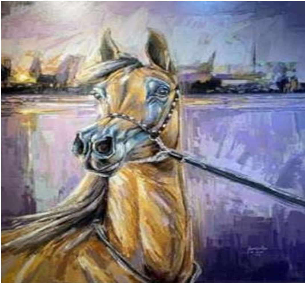
Figure No. (3)

The artist Fahd Khalif used the cubist style in Figure No. (4) through his arrangement