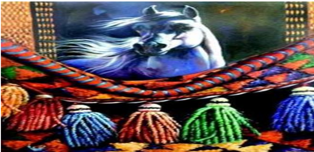
Figure No. (1).

In Figure (2), the artist Nasser Al-Dubaihi depicts the horse in an expressive style, so we see the horse's head colored grey And his steps, looking out from the balcony of the reddish-brown barn door and their steps, as if he was waiting for his owner