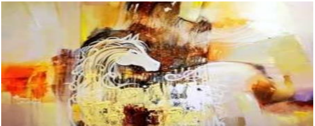
Figure No. (7).

One of the artists in the Kingdom of Saudi Arabia who excelled in depicting horses in a surreal style is the artist Nasser