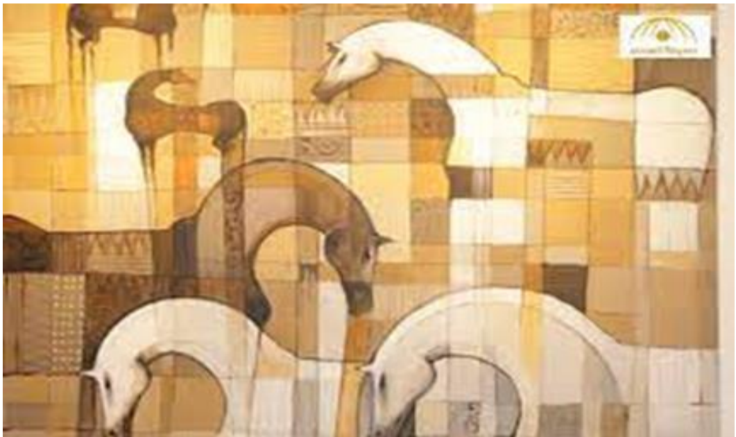
Figure No. (4).

And penetrated deep into their civilization and heritage.