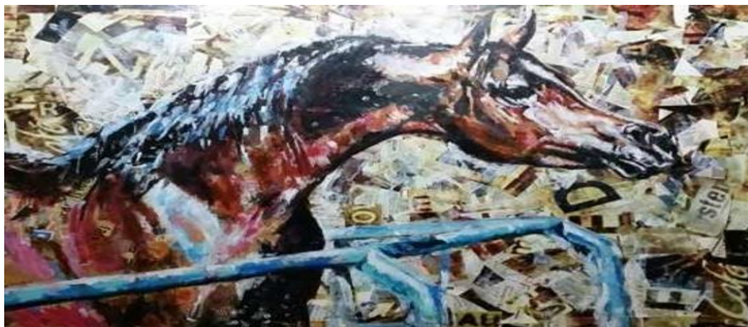
Figure No. (6).

Coloring it so that magazine and newspaper clippings appear from time to time in the horse's body, and the artist was able to