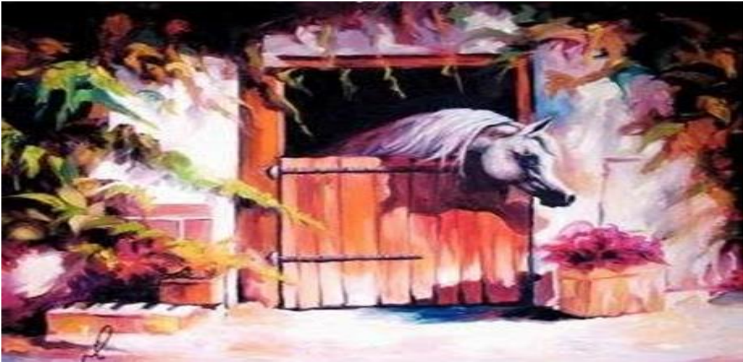
Figure No. (2).

Which gave the painting richness of color and texture through the movement of the brush. Its colors are distinguished by the fact that they record a color language. pure on flat plate