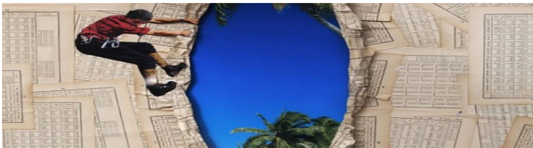
Picture No. (9).

His combinations play on the strings of dimensional aspects and the concept of graphic scales, in addition to incorporating a hint of meaning and poetry into his works, which stems from the influence resulting from the Surrealist school. As in picture (9)