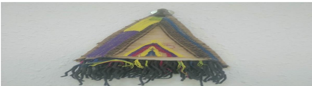
Handcrafted in hanging form (1)