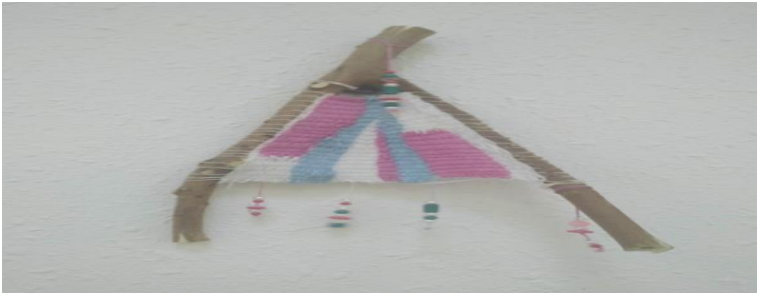
Handcrafted in hanging form (4)

The movement rhythm is achieved by the white feathers hanging above the work, as well as the threads containing the beads hanging below the work.